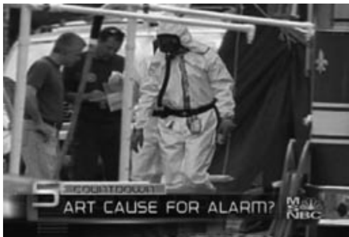
Art cause for alarm!